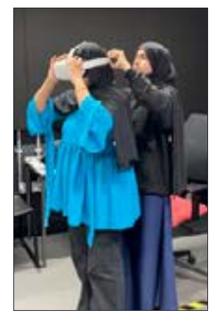
Young people experiencing the metaverse during a workshop at the School of Digital Arts, Manchester Metropolitan University.